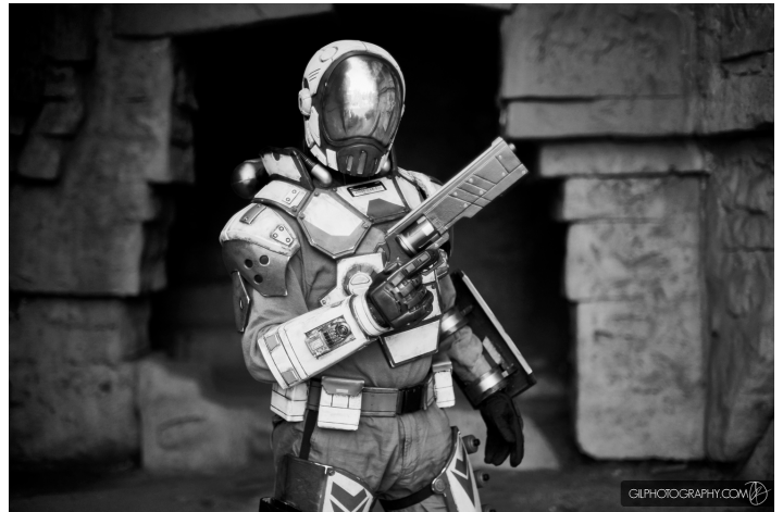
"Space Marine" ( eviltedsmith.com/space-marine )